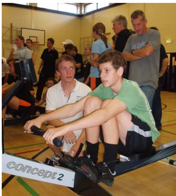
A Rower from Bottisham Village College gets ready to race.

On Saturday 14 th October 2006, over 60 young people from schools and rowing clubs throughout the region took part in the Cambridge Sport Lakes Junior Indoor Rowing Challenge 2006 at Parkside Community College, Cambridge. Participants lined up on indoor rowing machines to see if their team could follow in the footsteps of the country's rowing heroes and achieve gold.