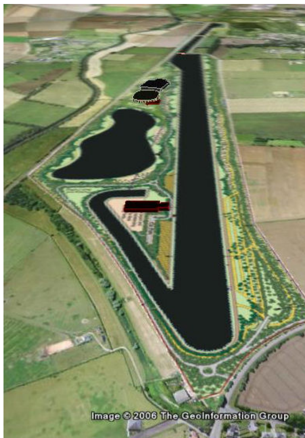
View from Waterbeach Main entrance south to Cambridge

The proposed park has been cited as a priority recreation and sporting facility in area structure plans and is intended to be a major resource for the fast expanding Cambridge region.