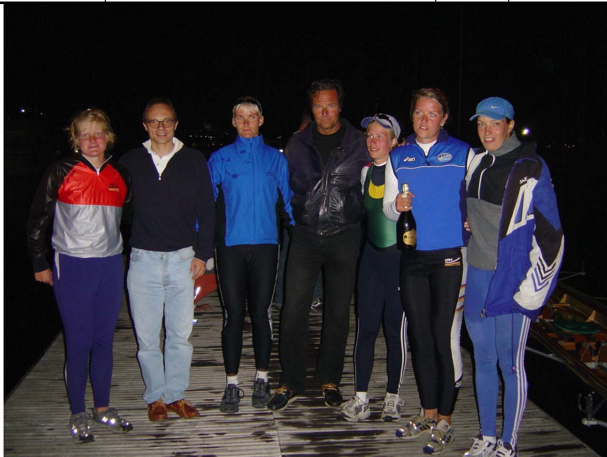
Dresdner Ruder-Club 1902 e. V. (Frauenpower) Record 2004 Elite Féminine